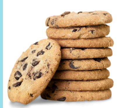
Cash only please.

BAKE SALE: HOT COCOA, CHOCOLATE CHIP COOKIES, GLUTEN FREE COOKIES, VEGAN CAKE